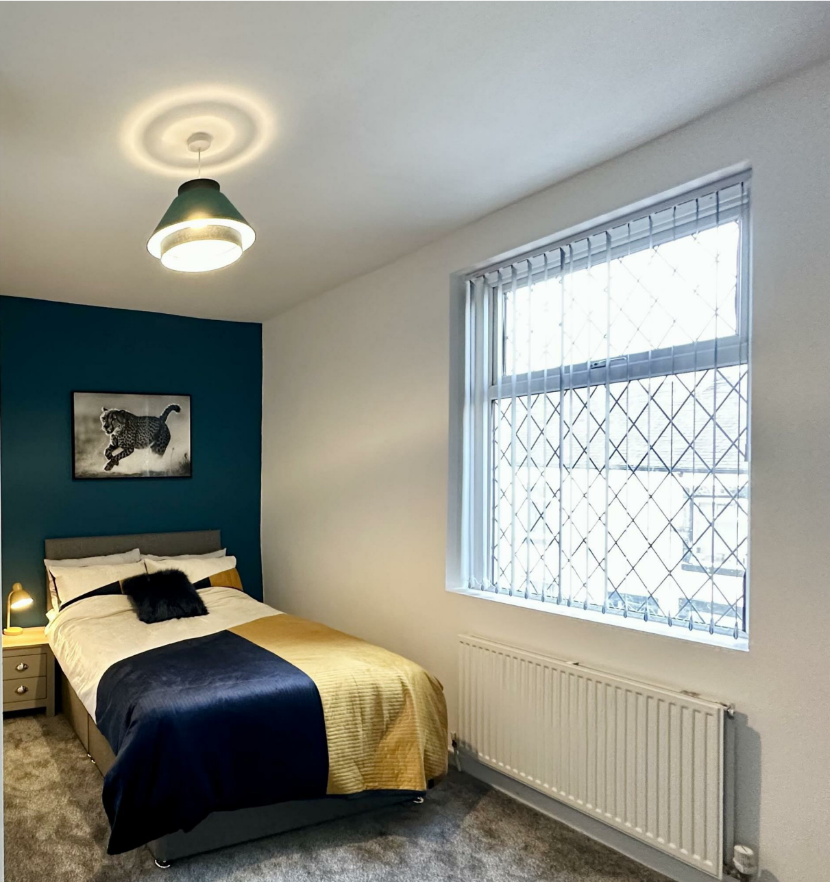
Room 3, 40 Berry Street, Burnley, Lancashire, BB11 2LG £115 Per week